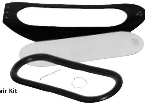
88VXAK Repair Kit

Contact your Bullard Regional Sales Manager or Inside Sales Representative for additional information.